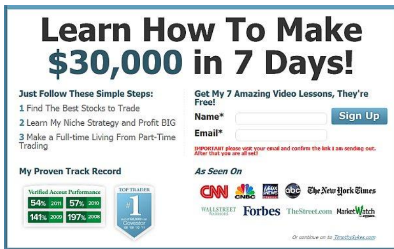
Figure 1 - Example of a Squeeze Page

There are two basic ways to develop a great lead magnet that people who are interested in your niche will want: Develop it yourself or use content that already exists.